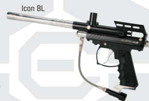
*Not Shown In Schematic.